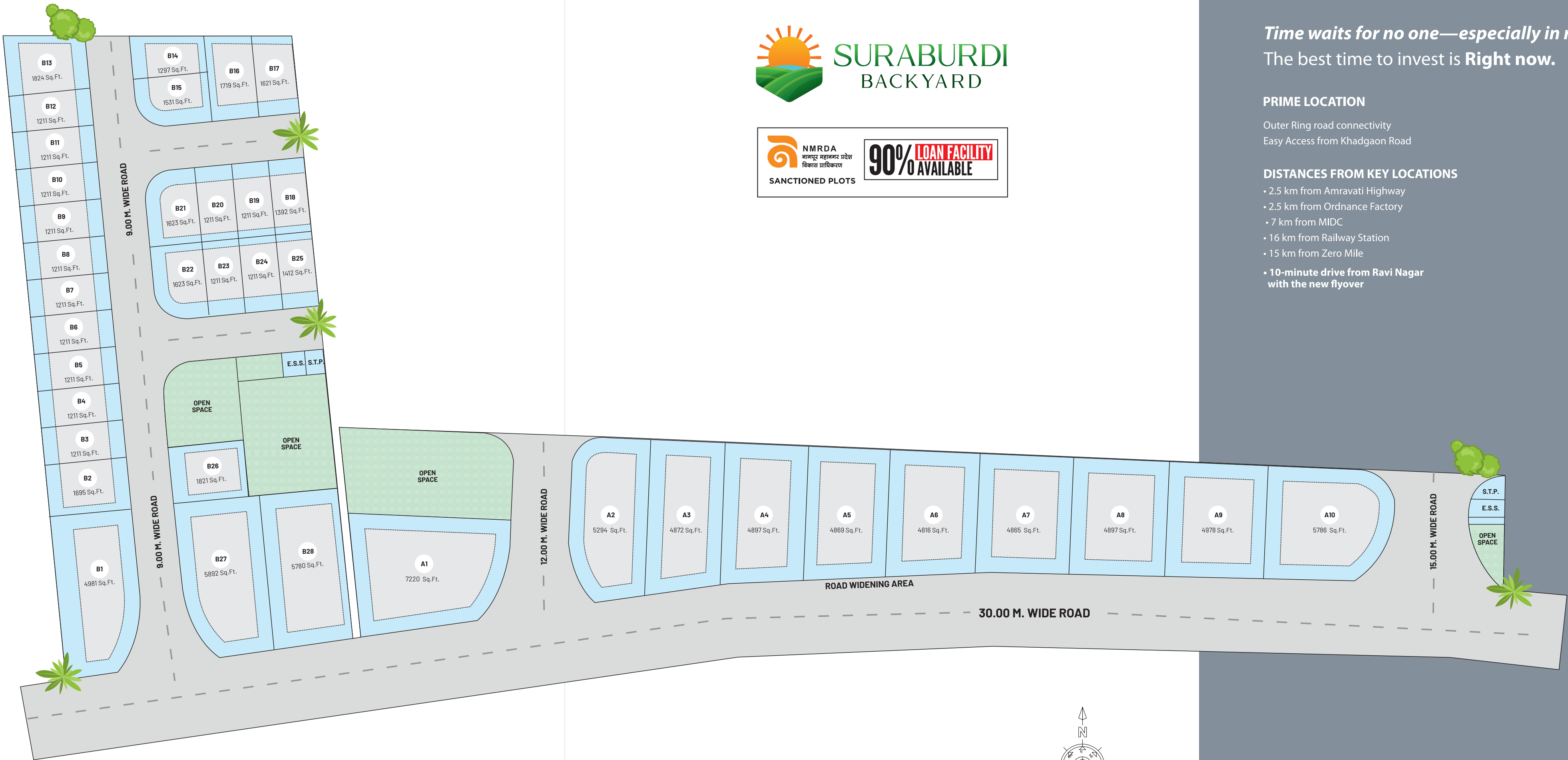
PROPOSED LAYOUT OF KH. NO. 121 & 3/2 AT DRUGDHAMNA, NAGPUR

1100 -5500 sq. ft. Residential & Semi Commercial Plots